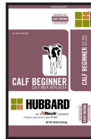
22-20 or 24-20 Calf Beginner AM BOV MOS FLY Instantized